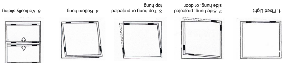
Typical glazing options showing position of glazing packers:

Arden Windows Ltd Manufacturers and installers of bespoke timber windows and door sets